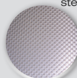
Squared stainless steel*