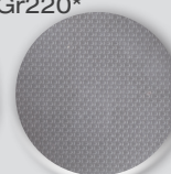
Linen stainless steel*