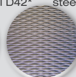
5WL stainless steel*