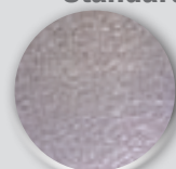
Leather grain stainless steel D42*