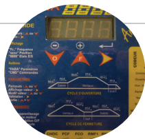
Optional automated version