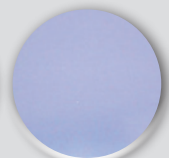
304 L or 316 L rough st. steel*