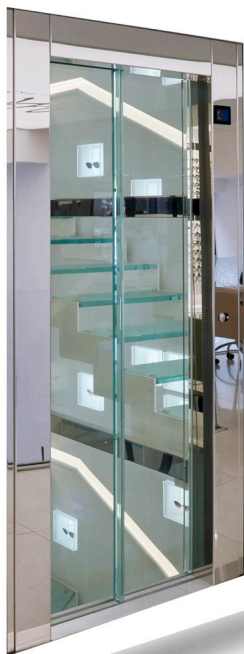
Optional Absolut Full Glass represented