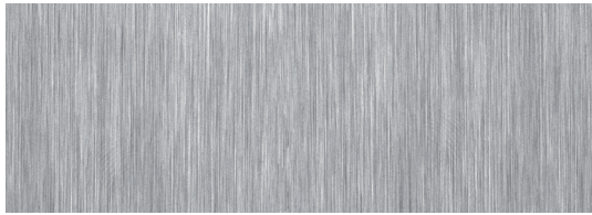
AISI 304 brushed stainless steel