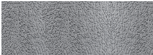
AISI 304 engraved stainless steel