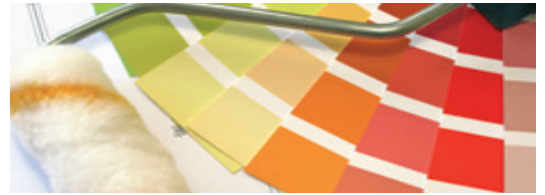
Standard RAL on request