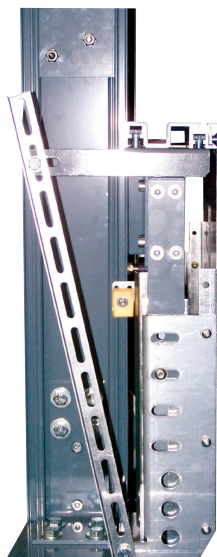
Jack 2 toe guard retracted

They incorporate a safety contact compliant to EN 81-20 / 50 for statement of the complete deployment.